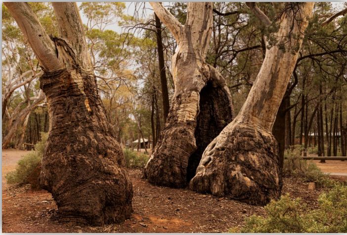
Trees in Riverbed by Hillary Gillett Image courtesy of Shutterbugs Photography Group